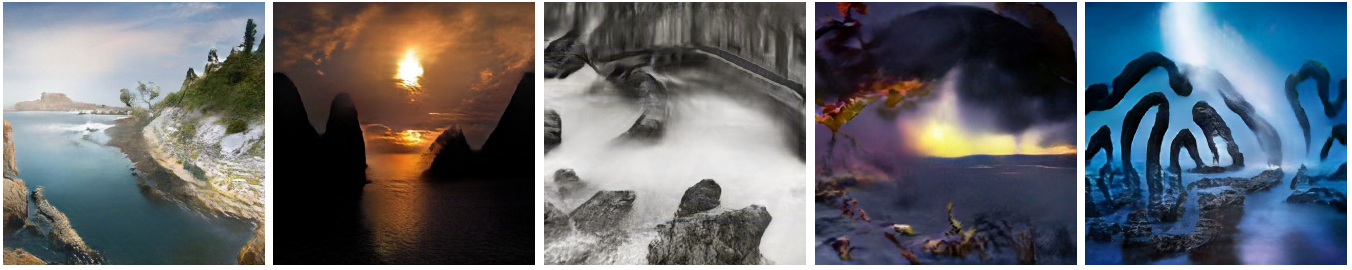
Fig. 2. Examples of participant output.

of it, I didn't think as much about the semantics of what I was saying, and so I allowed that to resonate more with my emotional self." This participant described the act of art-making as a process which allowed them to more easily connect with and find words for their emotions while they were speaking.